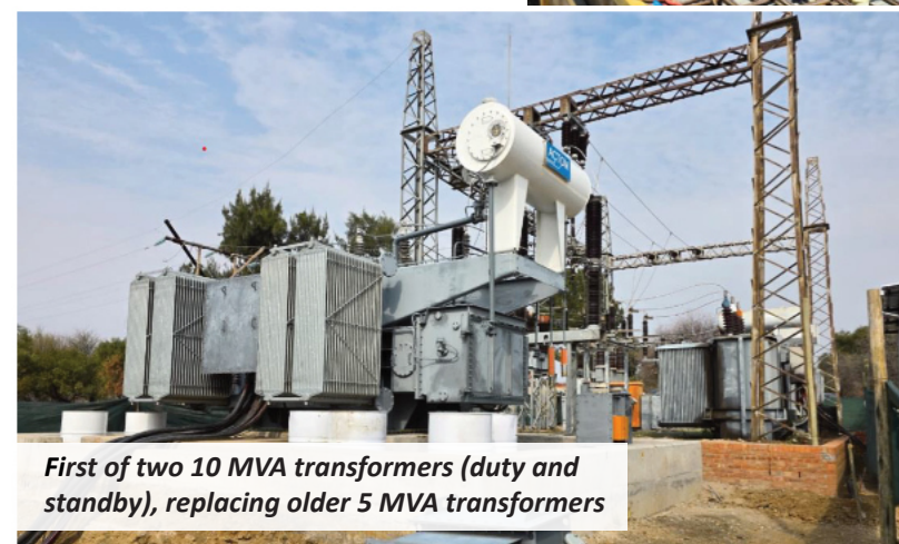
First of two 10 MVA transformers (duty and standby), replacing older 5 MVA transformers