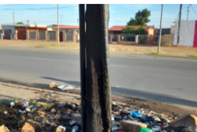
Corner of Mampe and Rosa streets

A series of well orchestrated and deliberate attacks occurred on our electrical infrastructure in January 2026.