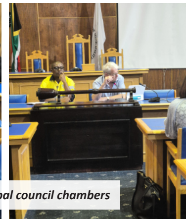
The oversight visit concluded at the municipal council chambers