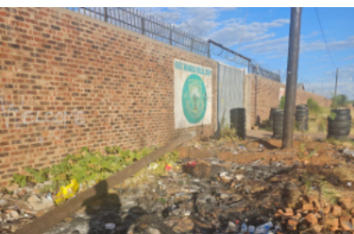
Tyala Street Substation

Text: Thabo Mothibi