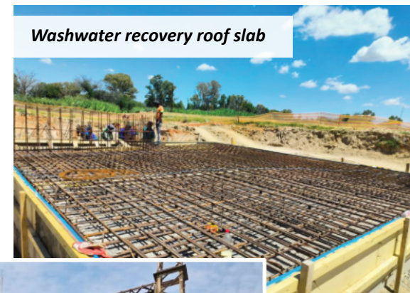
Washwater recovery roof slab