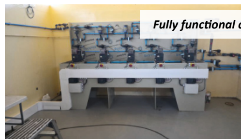
Fully functional chemical dosing system