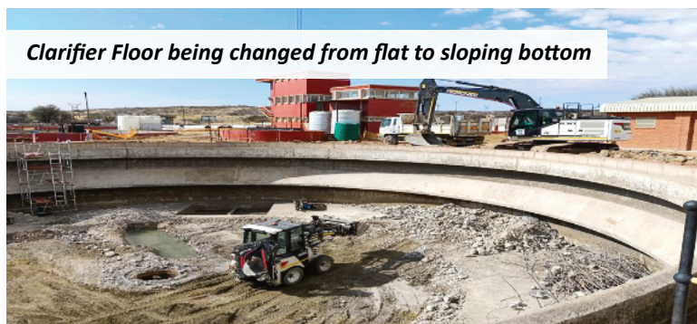
Clarifier Floor being changed from flat to sloping bottom