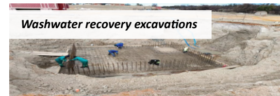
Washwater recovery excavations