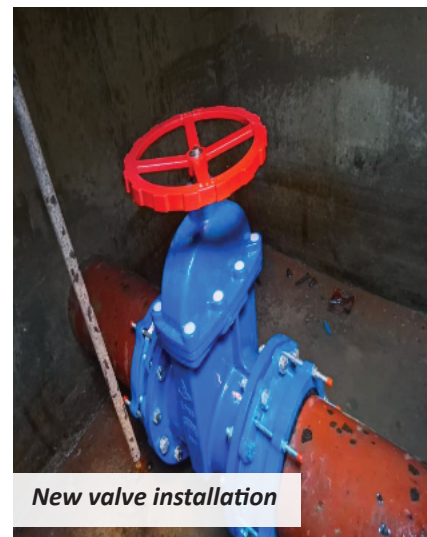
New valve installation