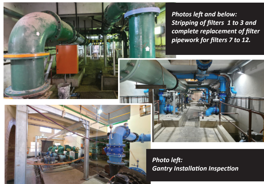
Photos left and below: Stripping of filters 1 to 3 and complete replacement of filter pipework for filters 7 to 12.

Sections of the Old Plant have already been recommissioned (Filters No 7 to 12) to supplement the supply while refurbishment at the New Plant continues. These upgrades are being carried out while water production continues, requiring careful coordination to balance construction activities with the need to supply water to Kimberley.