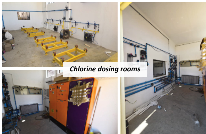
Chlorine dosing rooms