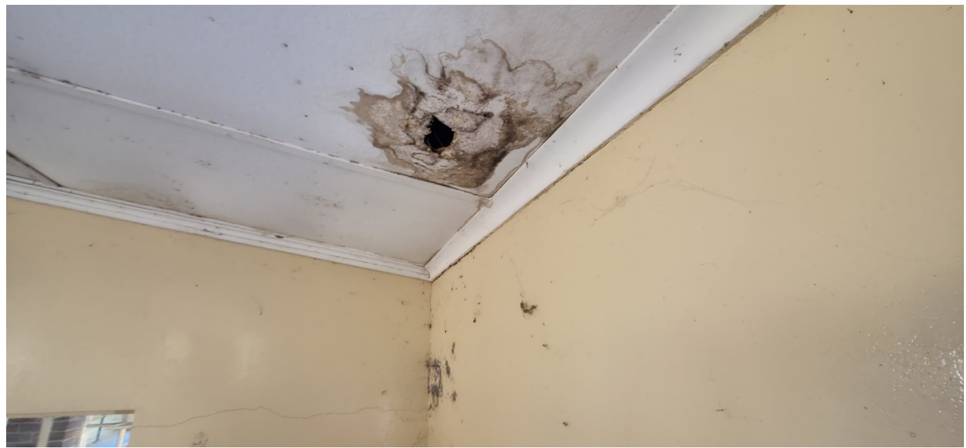
Ceiling above Filter No. 7