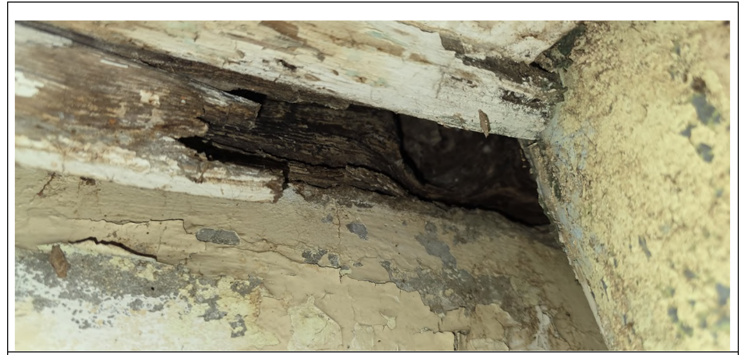
Ceiling above Filter No. 3