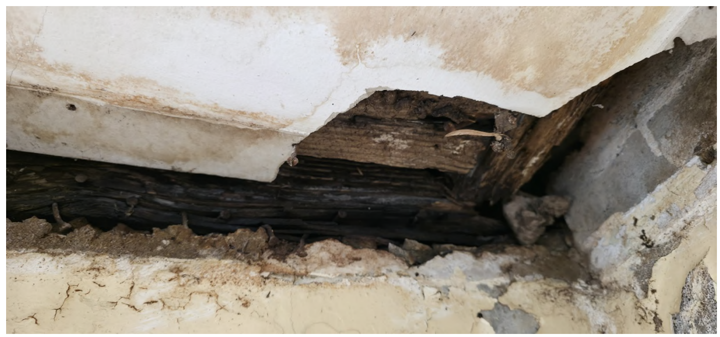
Ceiling above Filter No. 10