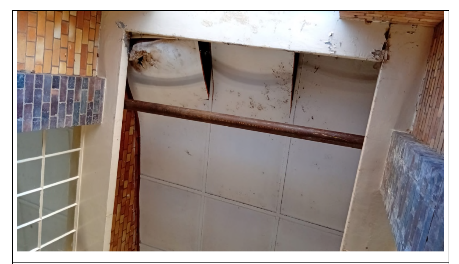
Passage between Filter's No. 1 to 6 and Filter's No. 7 to 12