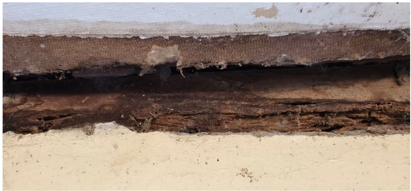
Ceiling above Filter No. 8