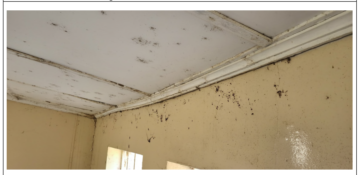
Ceiling above Settled Water Pumps No. 1 to 3