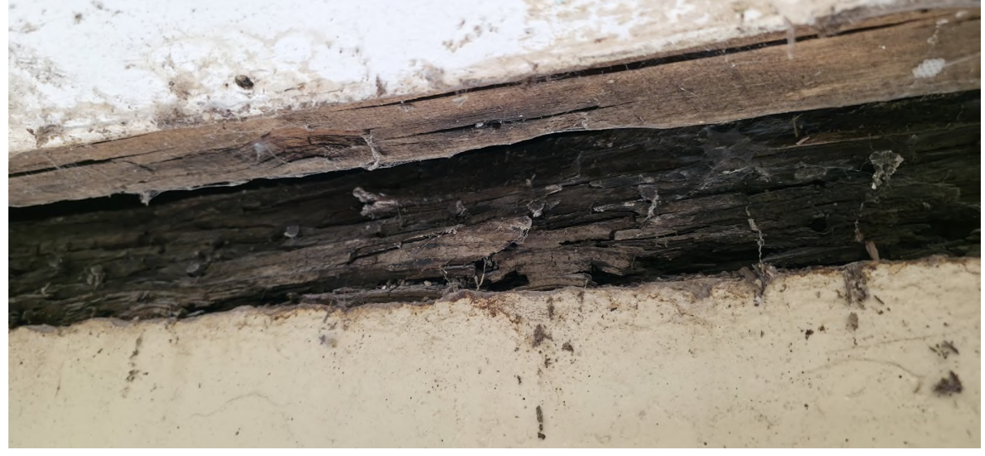
Ceiling above Filter No. 12