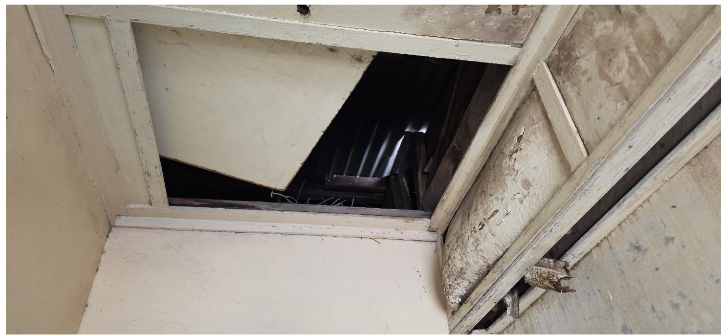
Access to Goods Lift Motor Room