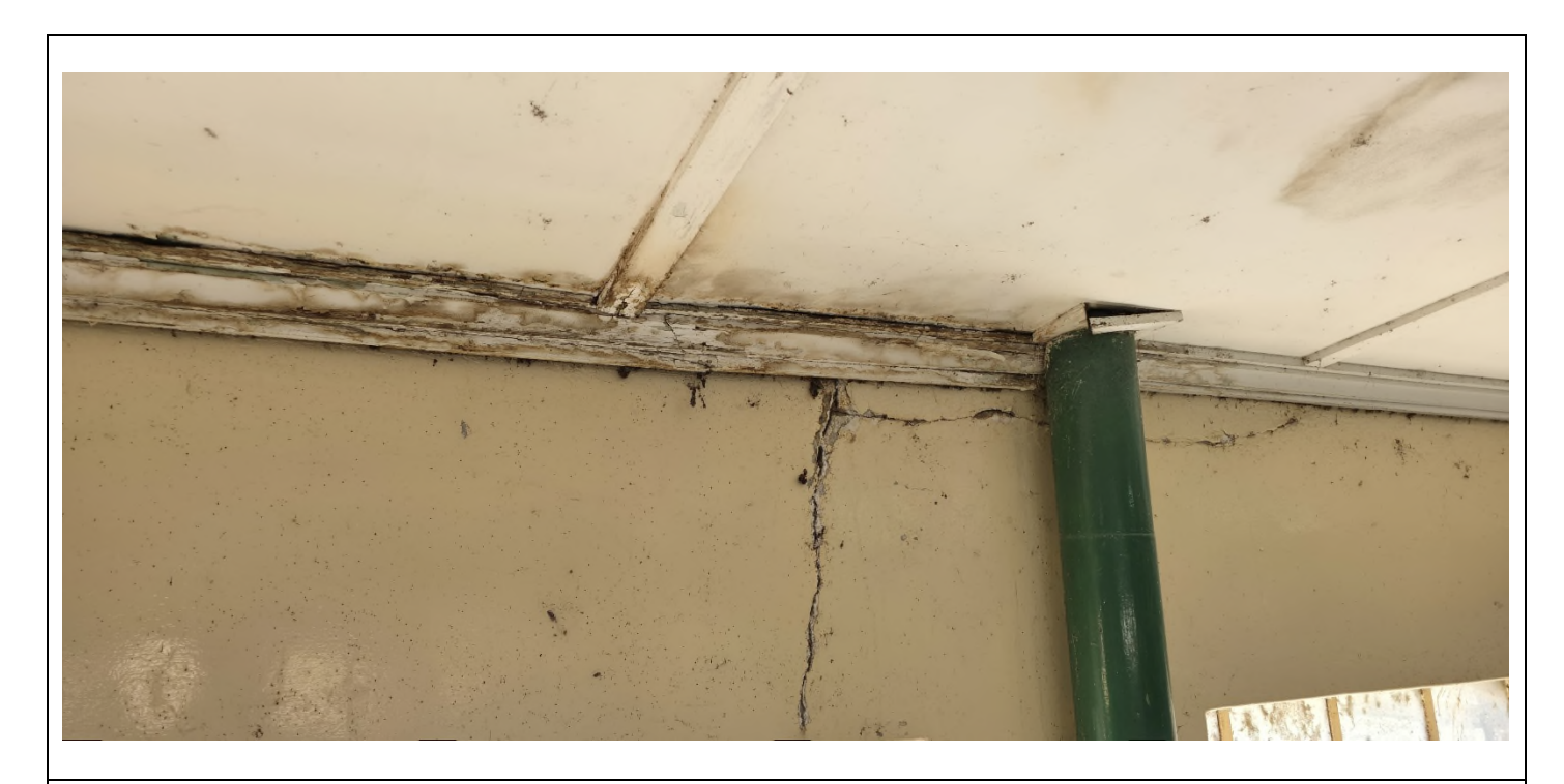
Ceiling above Filter No. 5