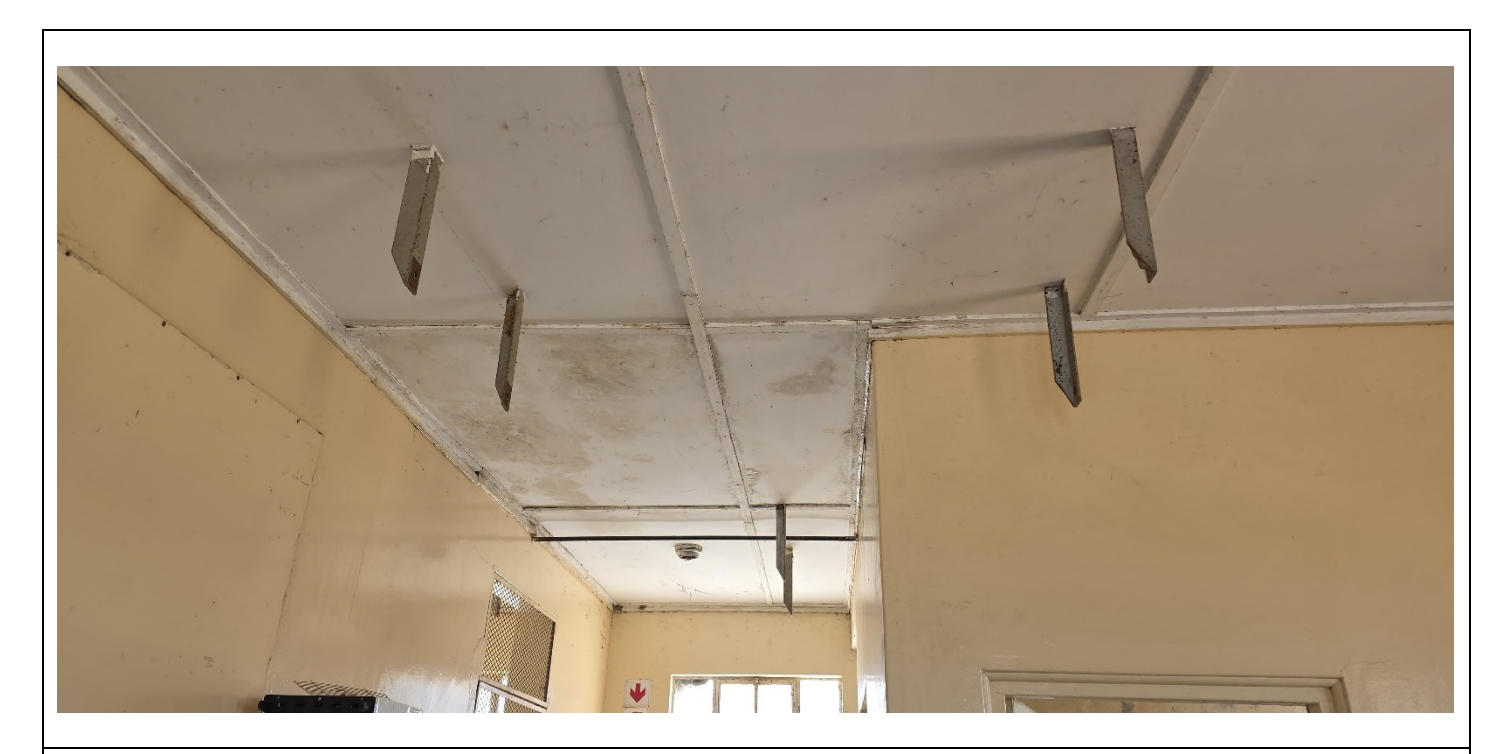
Ceiling in the Lime Dosing Room