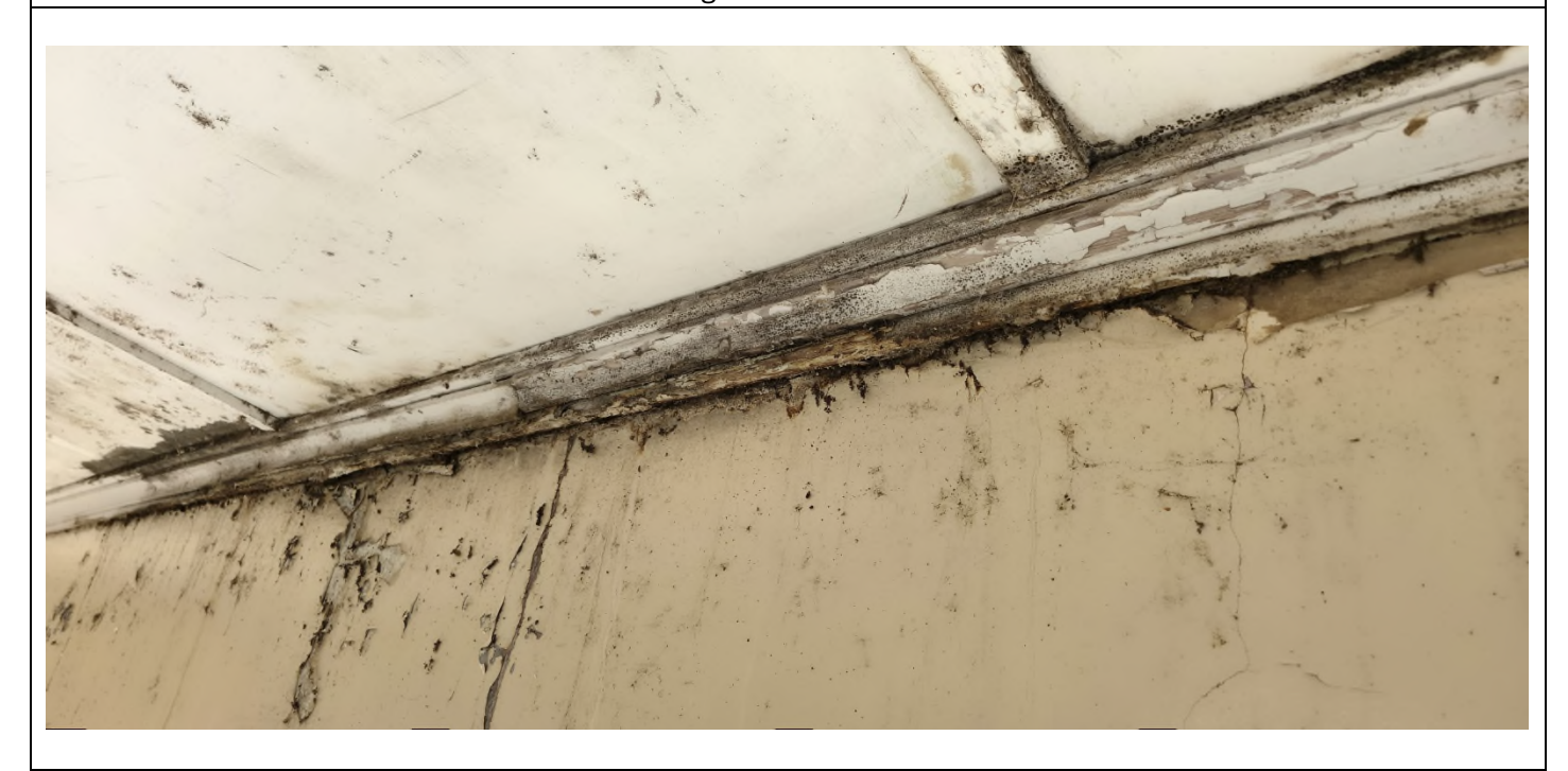
Ceiling above Filter No. 6