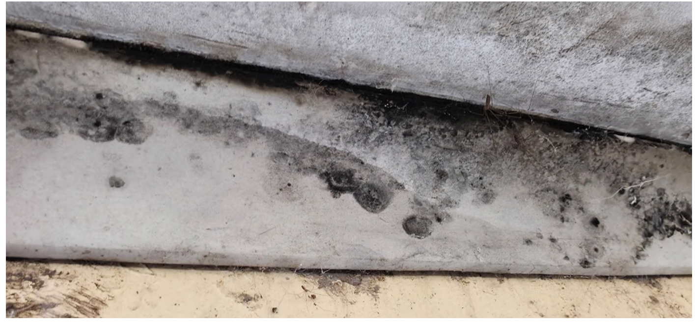
Ceiling above Filter No. 9