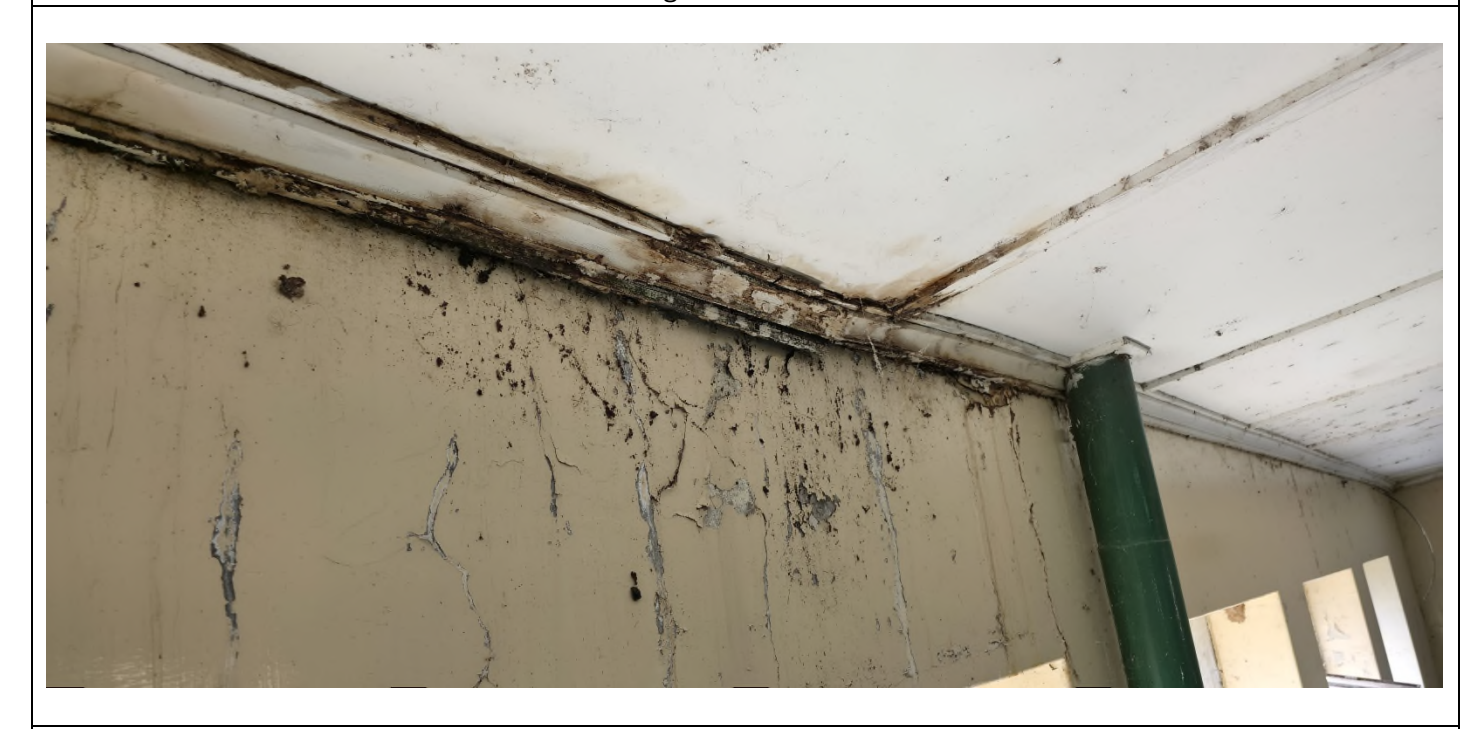
Ceiling above Filter No. 4