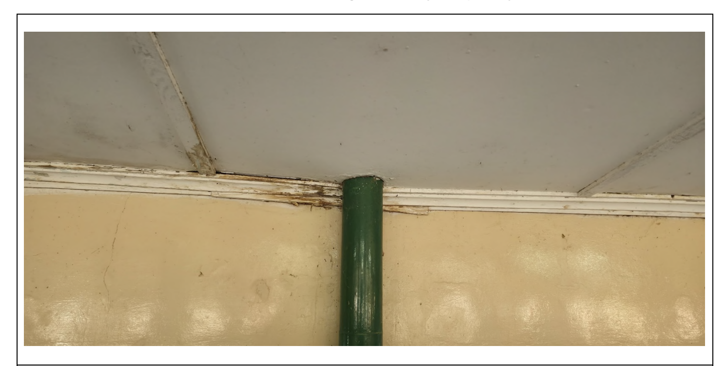
Ceiling above Filter No. 1