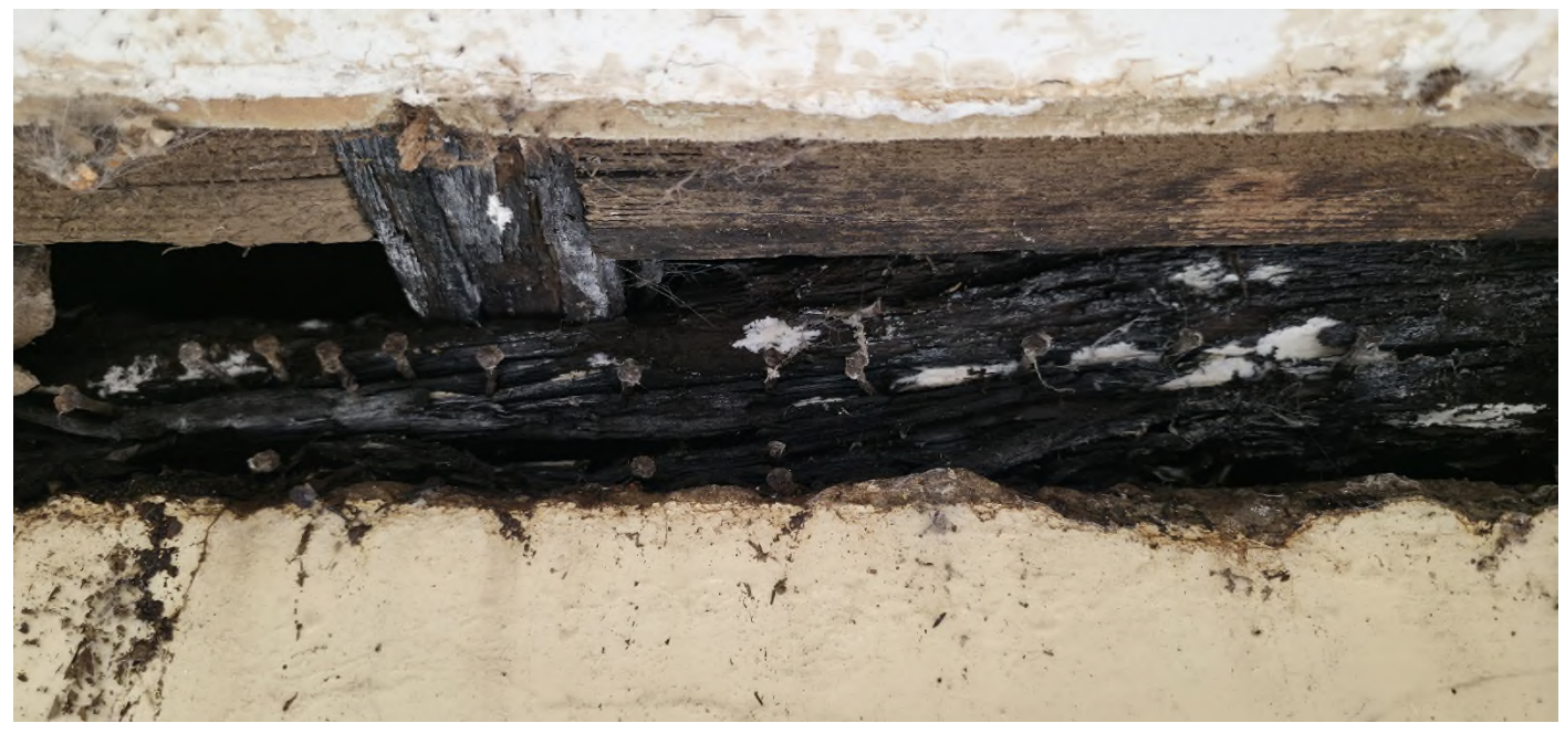
Ceiling above Filter No. 11