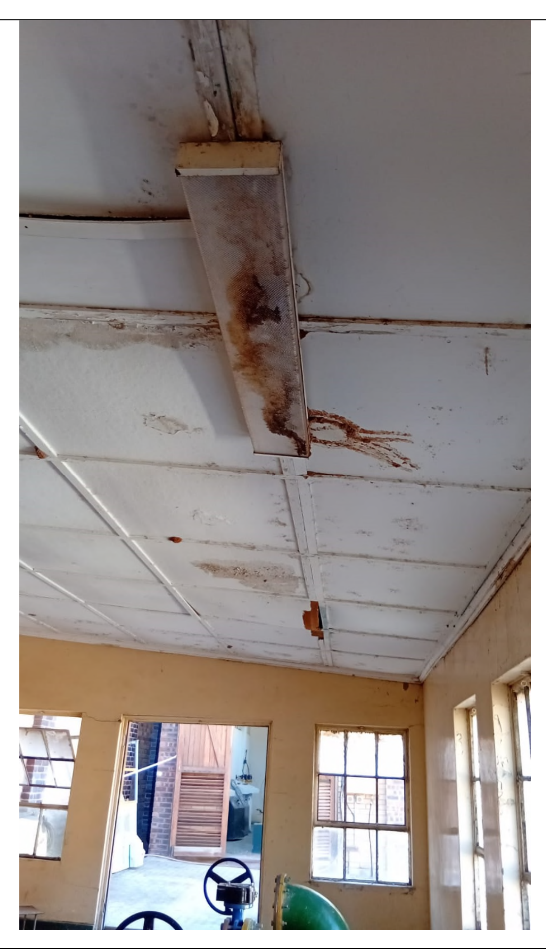
Ceiling in Settled Water Pump Room No. 2