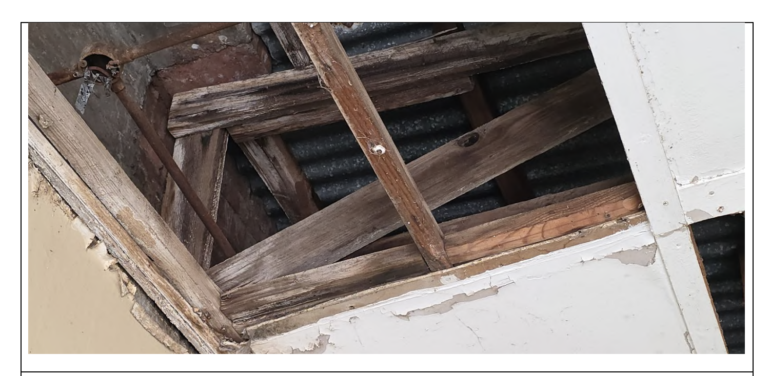
Ceiling above Staircase and Supervisor Office