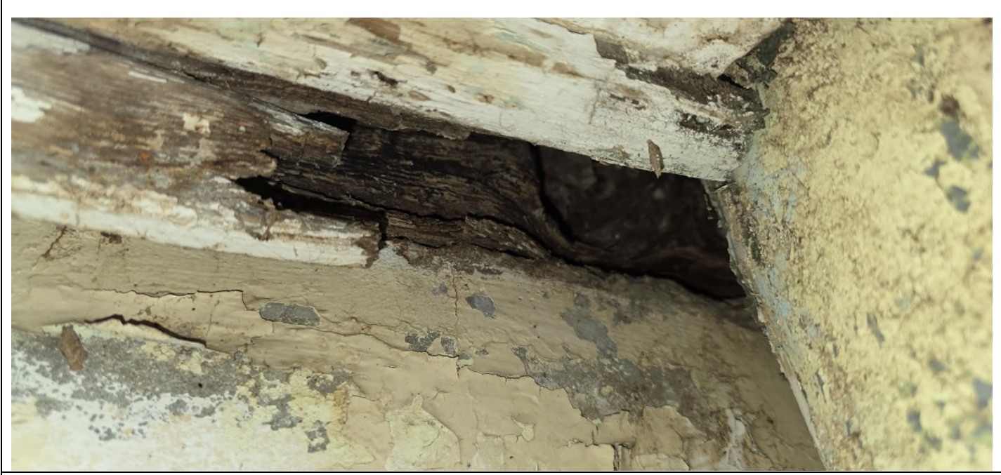
Ceiling above Filter No. 3