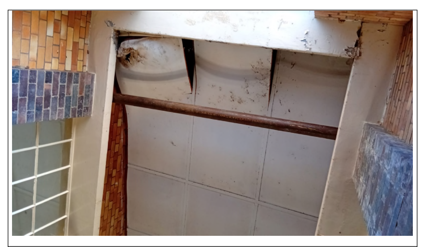
Passage between Filter's No. 1 to 6 and Filter's No. 7 to 12