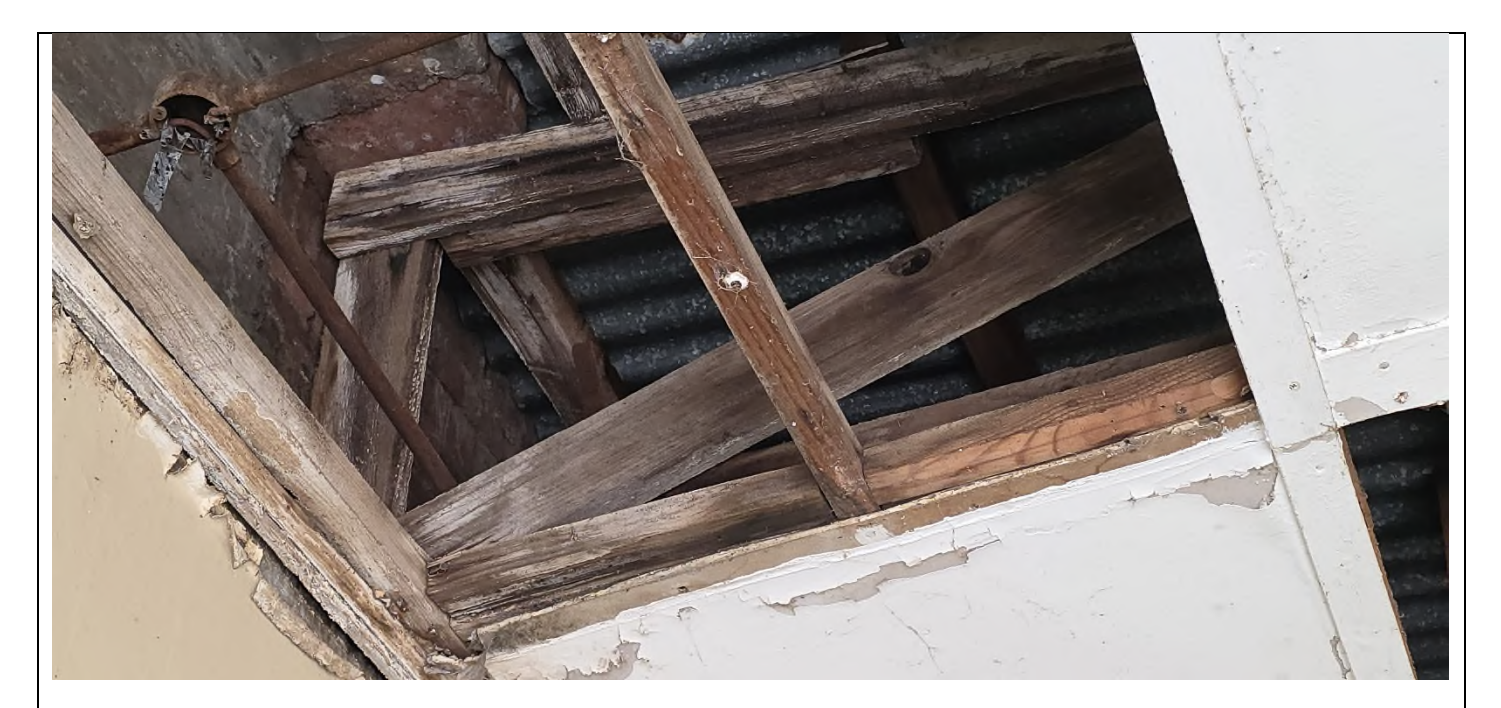
Ceiling above Staircase and Supervisor Office