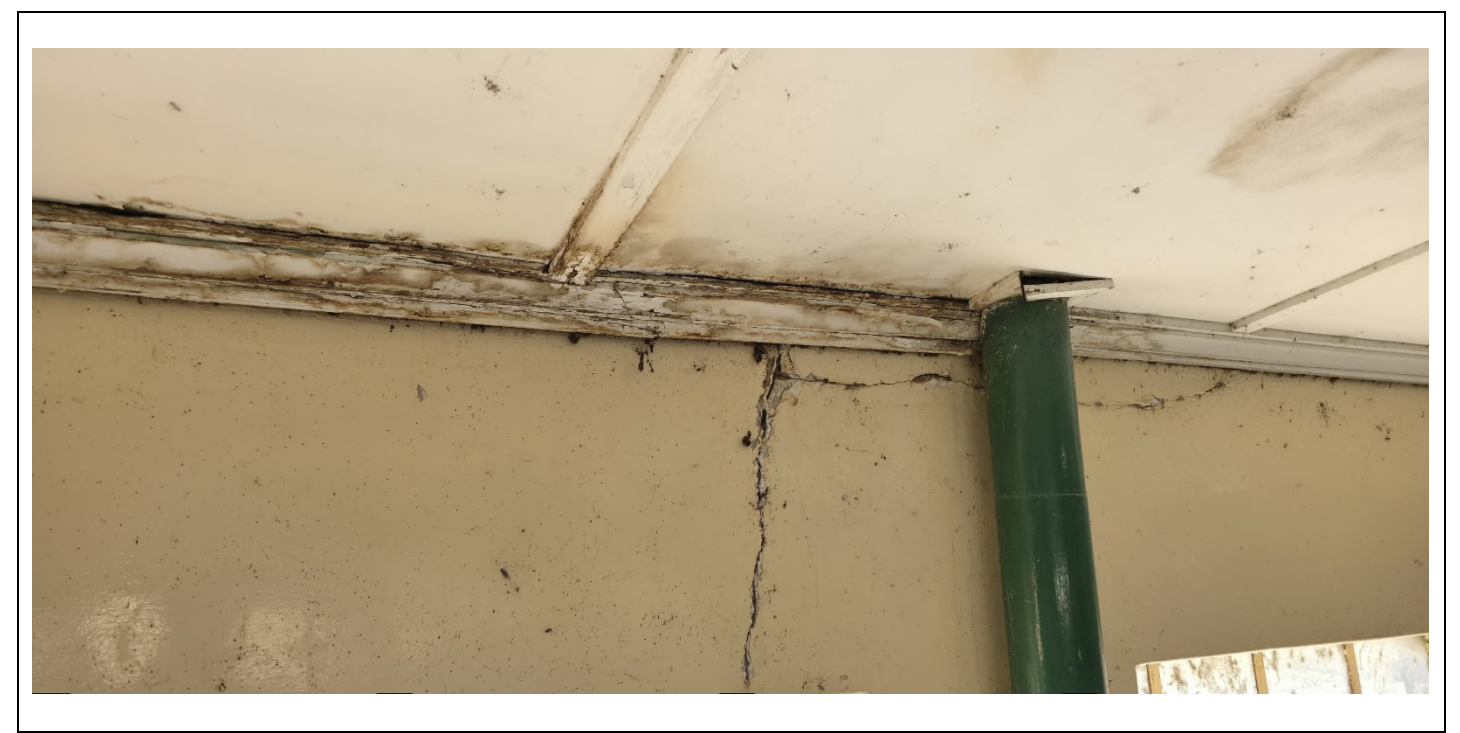
Ceiling above Filter No. 5