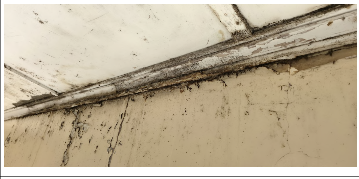
Ceiling above Filter No. 6