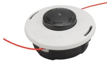
Nylon head Autocut 46-2