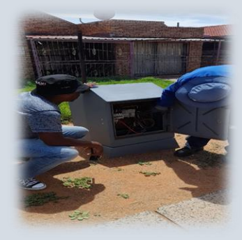
Photo2: Municipal staff repairing vandalised streetlights and kiosk in Retswelele & Kimberley North

Cable theft and vandalism is killing service delivery in SPLM. We urge the community to help us bring the perpetrators to book by reporting any suspicious activities to the municipality and SAPS.