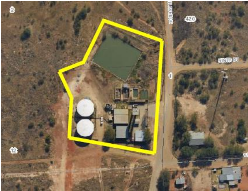
Figure 1: Area to be secured