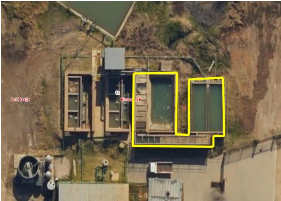
Figure 1: Area to be cleaned highlighted in yellow